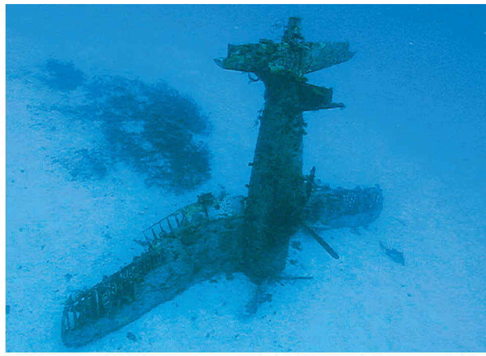
The Corsair F4F sitting nose end and tail straight up towards the surface.