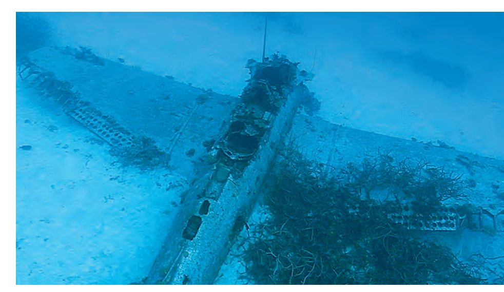
This Dauntless SBD here shows the metal "Swiss cheese" dive brakes on the trailing wing section.