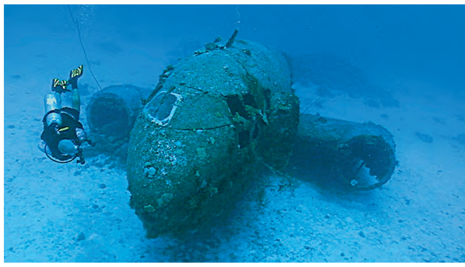
Diver "DJ" David Castle swims around the Commando R5C that carried supplies and troops during WWII, now missing wings and twin engines.

The Dauntless' distinctive feature was the split above and below perforated flaps on the trailing edge of the wing and a section below the fuselage.